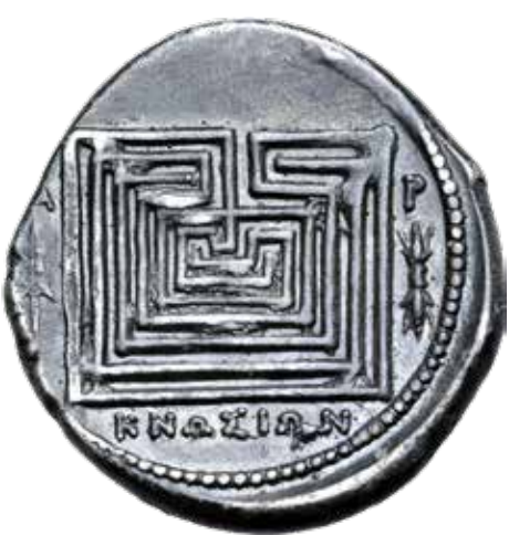
Above: An exquisitely preserved coin from Knossos featuring on its reverse a labyrinth now synonymous with the legendary King Minos